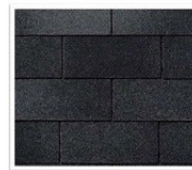
Roof: Rustic Black